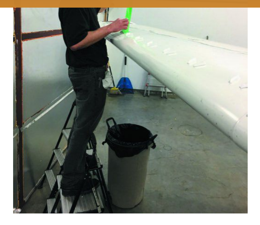
Removing the template after VG installation on a wing.

We'll write the conclusion first: In our opinion vortex generators (VGs) are so effective in reducing stall speed in virtually all stock general aviation singles, and Vmc in twins, that we think installing them significantly increases the level of safety. While we have never ranked add-on safety devices for airplanes other than to say shoulder harnesses are number one, we think VGs could arguably be number two.