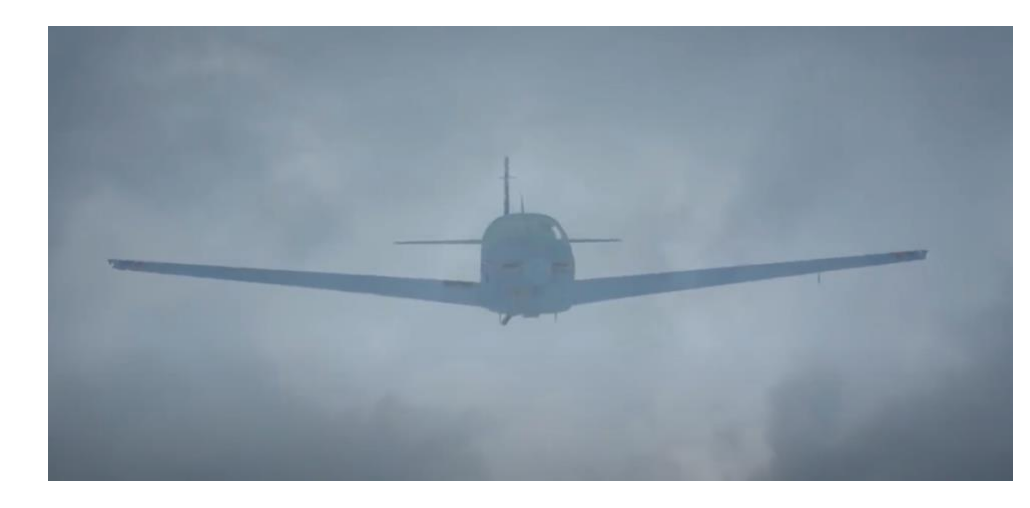
Involuntary IMC (video 15:05) (Reprinted from AOPA ePilot)

An instrument-rated pilot who is not current faces a failed engine and an unexpected IFR descent. Listen as air traffic control mounts a heroic effort to get the pilot down safely in this <u>AOPA Air</u> <u>Safety Institute Real</u> <u>Pilot Story</u>.