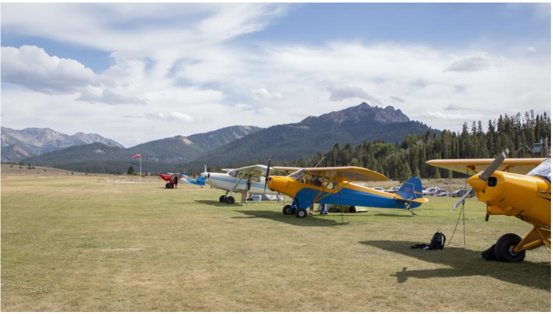
Smiley Creek Airport in Idaho's Sawtooth Mountains