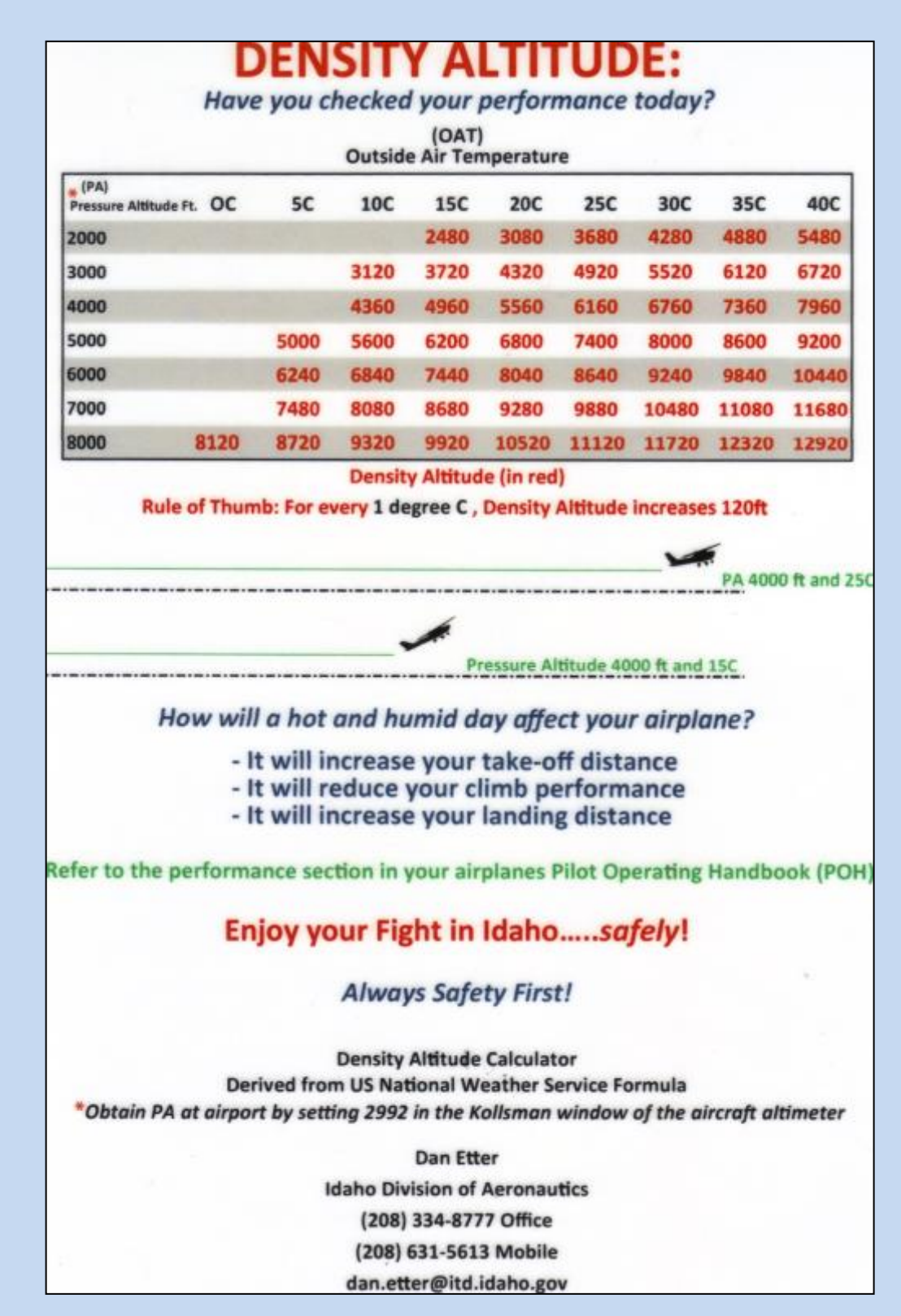
Membership Director Fly Smart, Fly Safe, Have Fun, and - Don't do anything Stupid!