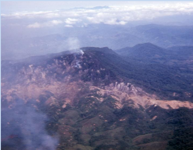
Part of Ho Chi Minh Trail

There were about 12,000 US helicopters in VN. Many as 5,000 destroyed. Being a helicopter pilot was classified as most dangerous job offered by the military. 1 in 18 helicopter pilots did not return alive. I am thankful and blessed to not have my name inscribed on that black granite wall in Washington D.C