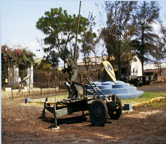
37mm Soviet Built

At end of second squeal a radar-guided 37mm round is on its way to greet you! Red glowing object that grows larger as it gets closer. Air crews were instructed to immediately dive & turn 90 degrees to avoid getting hit. Of course this helpful information was available only “after” the initial thrust into the Valley of Death. Now we really understood why hearing was part of flight physical. If you missed picking up the squeals or only heard the second thinking was it the first – whole day could be ruined quickly. Several times while flying in or near the valley I did pick up the ominous squeal. Couple times we saw rounds passing us especially glowing at night. While flying to a combat assault we did so in a loose trail formation. This provided each ship the ability & space to take evasive action if need be. Imagine the stress placed on each crew not knowing if a 37mm round had your name on it. Talk about keeping a sterile cockpit. Each aircraft had 3 radios – FM (talk to ground troops), VHF (talk with artillery, gunships, & Air Force), & UHF (between our aircraft). With 3 radios squawking it sometimes is difficult knowing which it was. It was our company SOP for one pilot to closely monitor the FM for 37mm squeals & the other pilot to listen to the other two radios. I got so I could monitor all 3 & distinguish between each. Was this Darwin’s “Survival of the Fittest”?