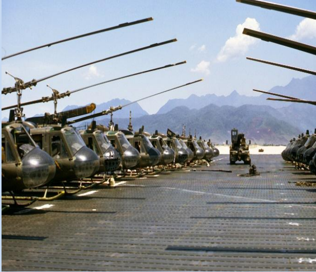
Damaged from A Shau Valley

The gun ship cover was great keeping the little bastards in their spider holes. We took hits but nothing critical was damaged. Very thankful none of my crew was hit. We fly direct to Camp Evans Medevac pad on East Coast with gunships (Tomcat call sign) providing aerial coverage. I call ahead to alert medevac pad what we had on board. Medical personnel & gurneys were ready on our arrival. I don't know the final outcome of those we brought out. At least 3 were KIA when placed in our ship. Several had serious wounds. Lots of blood covered our cargo deck. As we cleared the valley we hear the mission controller call in fast movers to drop liquid fire (napalm) on the downed helicopter wreckage to prevent any possible salvage by Charlie & frying him in his spider holes as well.