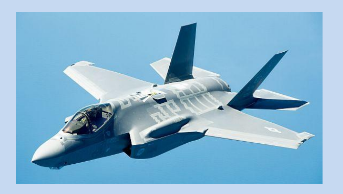
The Art and Science of Flying April 23, 2016 from 8:00 am until 5:00 pm.