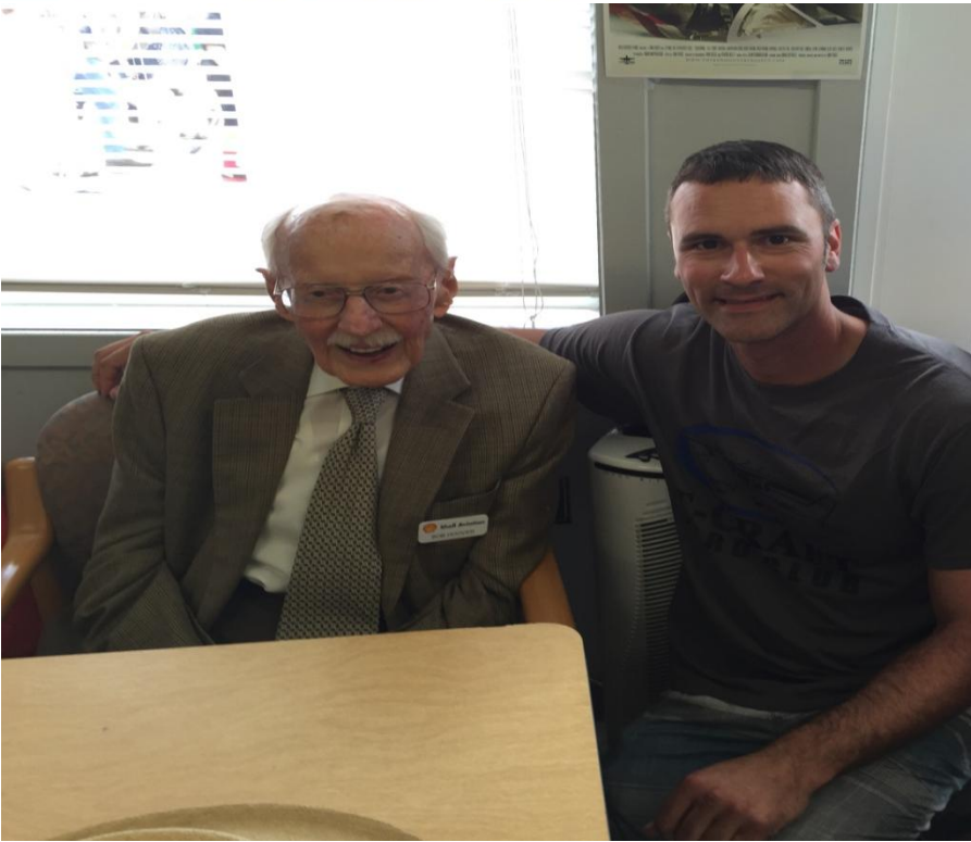
Bob Hoover made my day