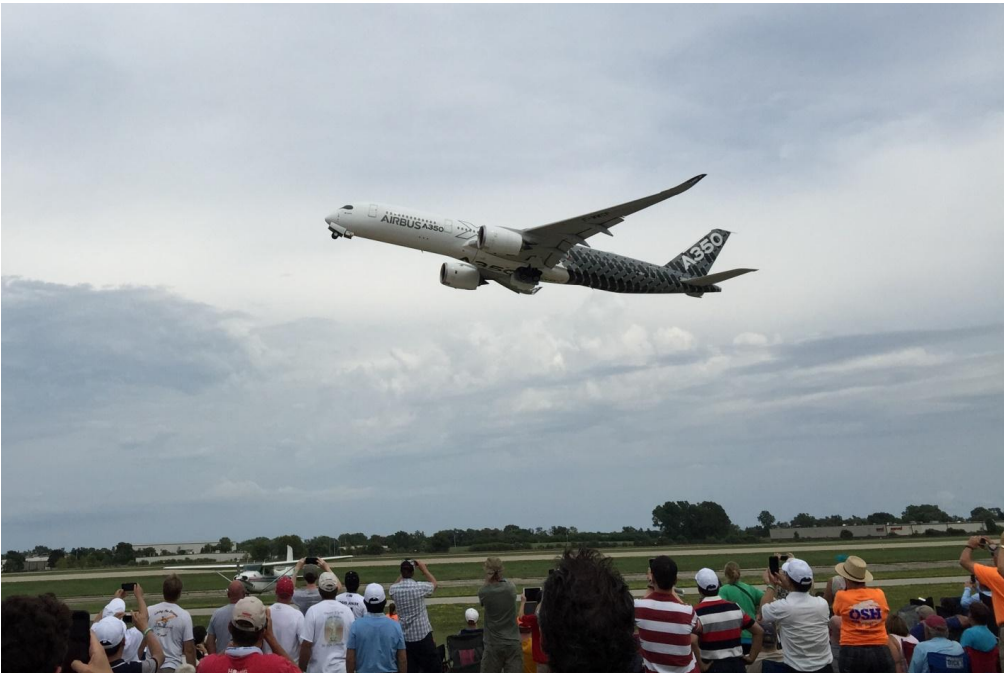
Airbus A350XWB performing a flight demonstration