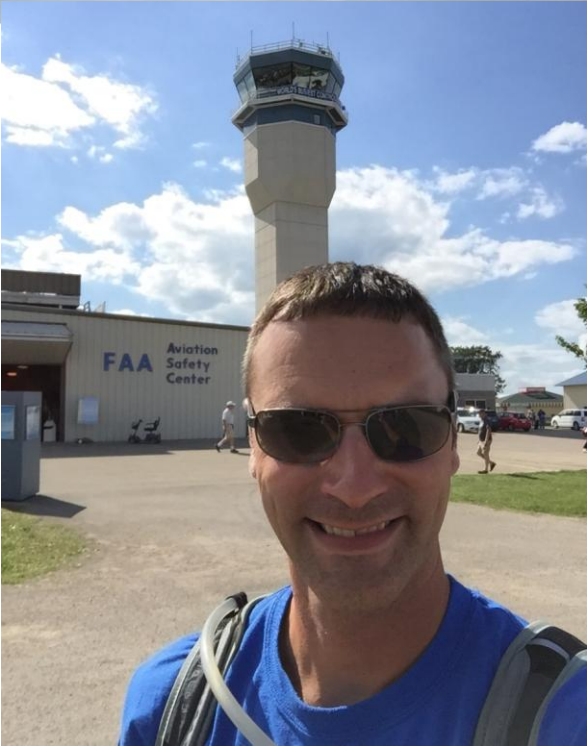
Selfie in front of the busiest tower in the world (for a week)