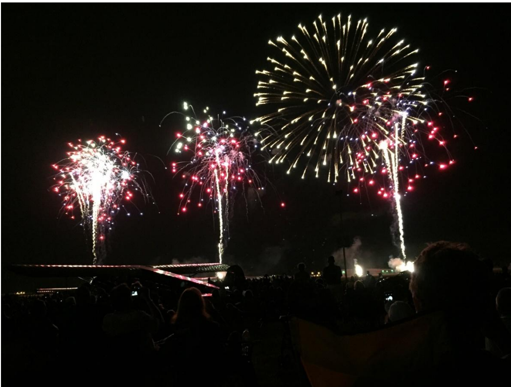
Night airshow and fireworks on the flight line.