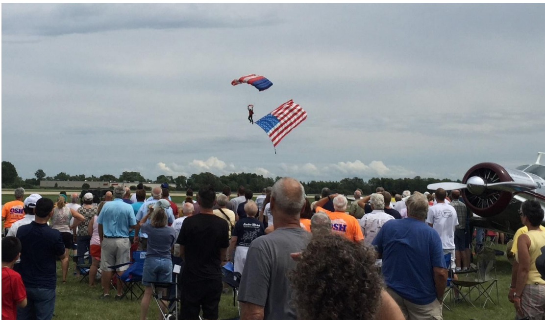
The airshows begin