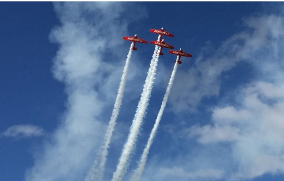
Aeroshell Aerobatic Team