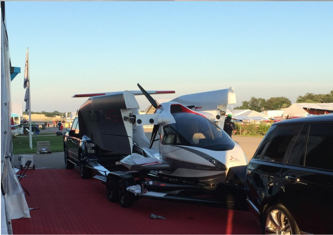
Icon A5 – This is my new boat. Not very practical in Idaho, but it does have a good story and ingenuity behind it.