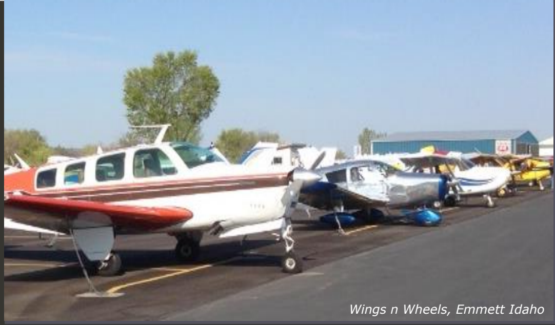
Wings n Wheels, Emmett Idaho

T-Craft Aero Club Inc., All Rights Reserved