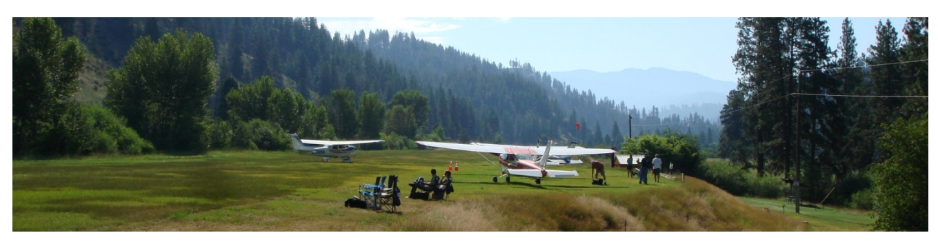
[A warm, sunny day in Garden Valley]