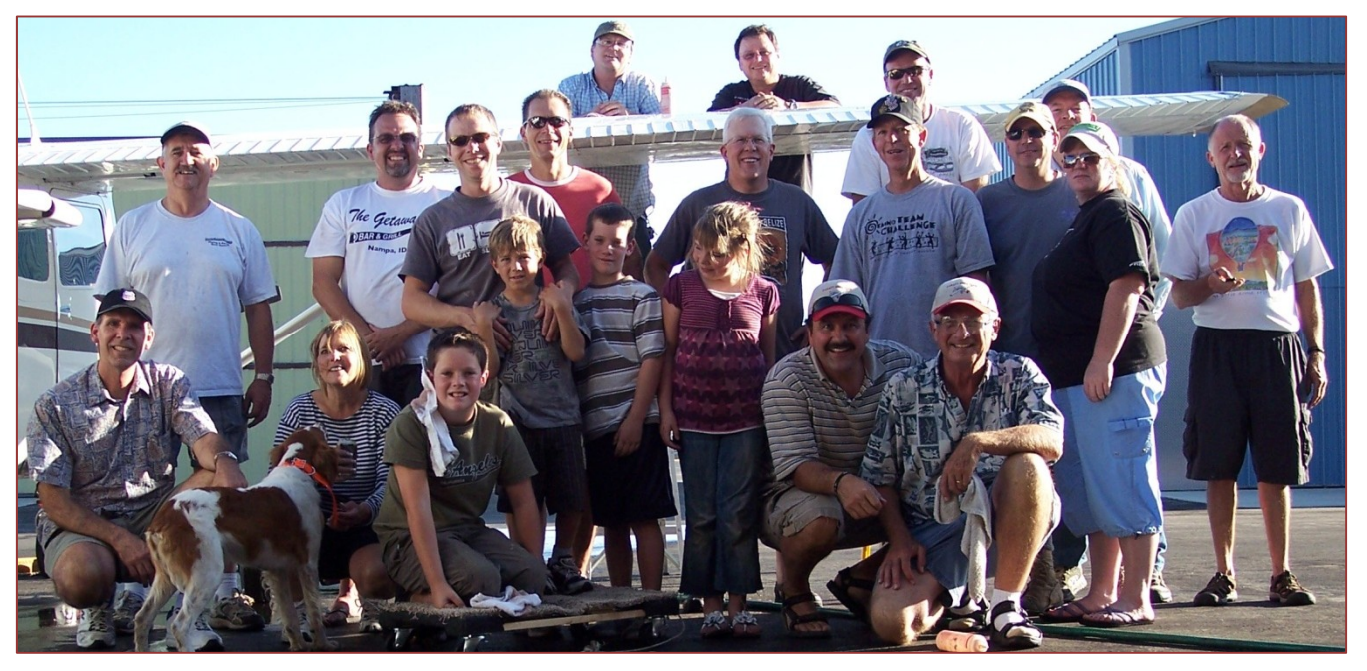
[Plane wash crew 2009]